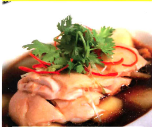
梁妈妈鸡饭 Mama Leong's Chicken Rice $9.90 per person $14.00 (Half chicken) $28.00 (Whole chicken)