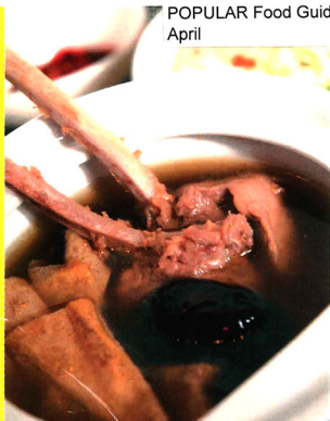
羊肉骨茶 Rack of Lamb Bak Kut Teh $14.00

A dining place that understands what diners want – healthy choices and quick bites which does not compromise on taste is what Space is all about. Featuring local favourites with a connoisseur twist, the innovative menu highlights premium ingredients within familiar dishes. Mama Leong's Chicken Rice has been perfected using the secret recipe consisting of succulent pieces of slow-poached chicken, fragrant glutinous white rice mix, accompanied with a tantalizing chilli-calamansi sauce and special dark sauce. The Rack of Lamb Bak Kut Teh uses the most tender baby lamb rack which is flown in from New Zealand. So next time you attend a performance, drop by Space for a quick yet satisfying dining solution!